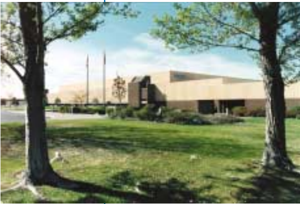
Philips Semiconductors Albuquerque, New Mexico

"The system works exactly as planned. First and foremost, it helps us provide a very safe and secure work environment. Additionally our security folks love it because it's so much easier to use. Our emergency response team is very happy with it because it gives them real-time information. It makes their job a lot easier."