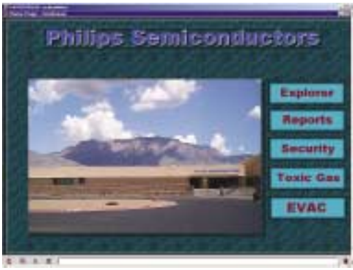
CyberStation's Dynamic Graphic Display