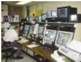
Security Control Center

With Andover Controls equipment and the excellent service from Entech, Philips Semiconductors can be assured of a safe and stable environment and concentrate on what it does best — supplying good semiconductor chips to its customers.