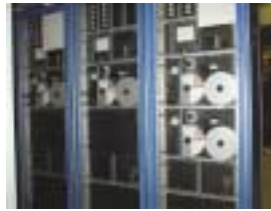
MDA Gas Monitoring System